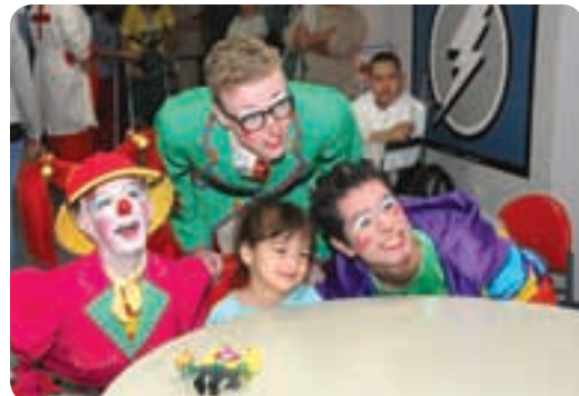
Clowns from Ringling Brothers and Barnum & Bailey's "Zing Zang Zoom" visited patients in the Children's Medical Center.

The need is great. Another example is families of babies in our Level III Neonatal Intensive Care Unit. This fund can provide help, such as cribs and baby supplies for needy families, or transportation to the hospital for families who live in distant counties.