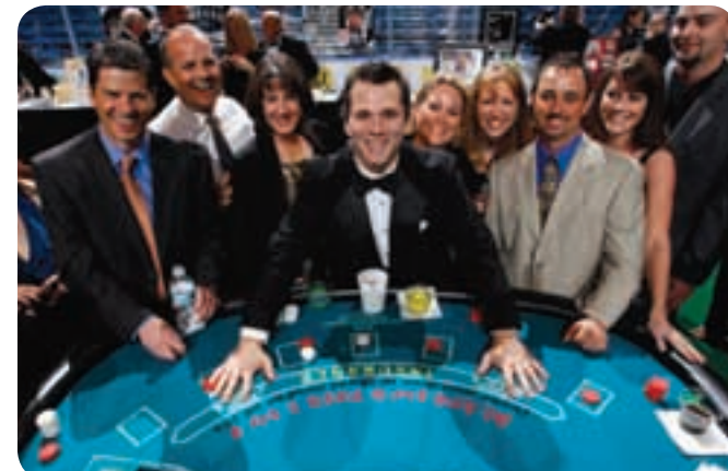
Marty St. Louis deals blackjack for guests at the Tampa Bay Lightning Foundation's Glitz & Sticks benefiting the Pediatric Intensive Care Unit.