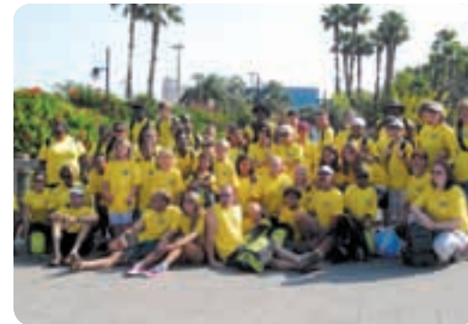
Each year the TGH Foundation and Tampa Firefighters and Paramedics, IAFF 754 send over 40 children who are burn survivors to Camp Hopetake.

Planning for the camp occurs all year. Staff members from the Regional Burn Center at Tampa General Hospital recruit the campers, plan and then coordinate the camp's activities alongside Tampa Firefighters and Paramedics, IAFF 754.