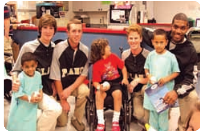
Members of the Plant High School Baseball Team take a break from practicing for the state championship by visiting with patients in the Children's Medical Center.