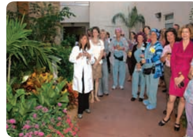
TGH employees gathered for the opening of the Employee Garden Retreat which was funded through the 2008 Employee Campaign.