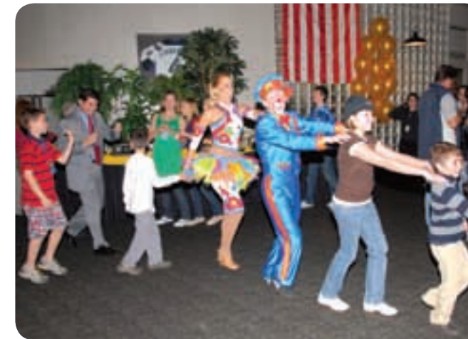
Circus clowns lead a line dance during the Patrons' Party.