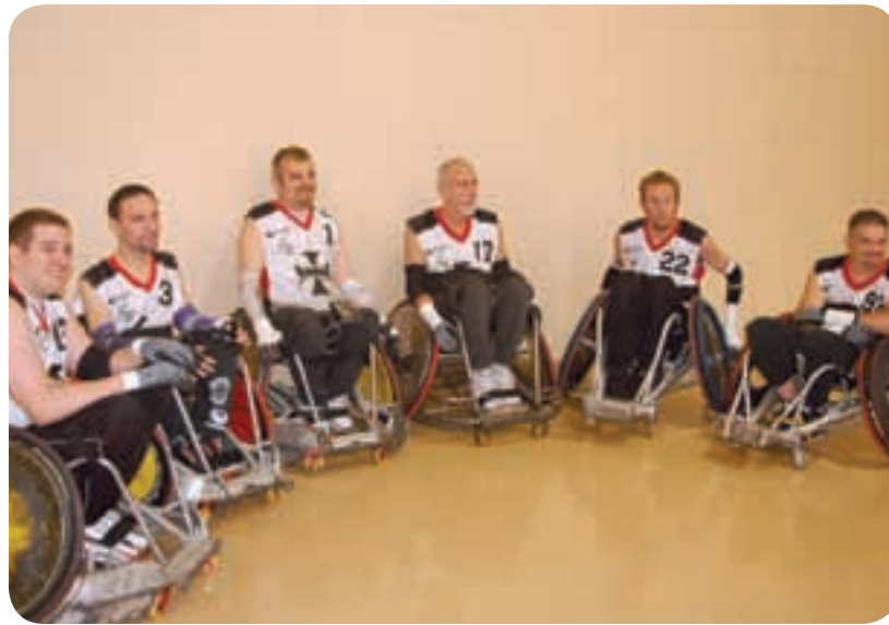
Members of the Tampa Generals Quad Rugby team gather prior to the start of tournament play.

Every January, the Generals host a three-day international rugby tournament where teams come from around the world to compete. The tournament is made possible because of the support from the Tampa General Hospital Foundation. The Tampa General Rehabilitation Center provides wheelchair accessible vans and recreational therapy staff to transport visiting teams during the event. Nurses and therapists use the tournament to reinforce to patients that a disability does not have to be limiting and that there are activities available for the spinal cord injury community. Patients not only need to hear about activities available to