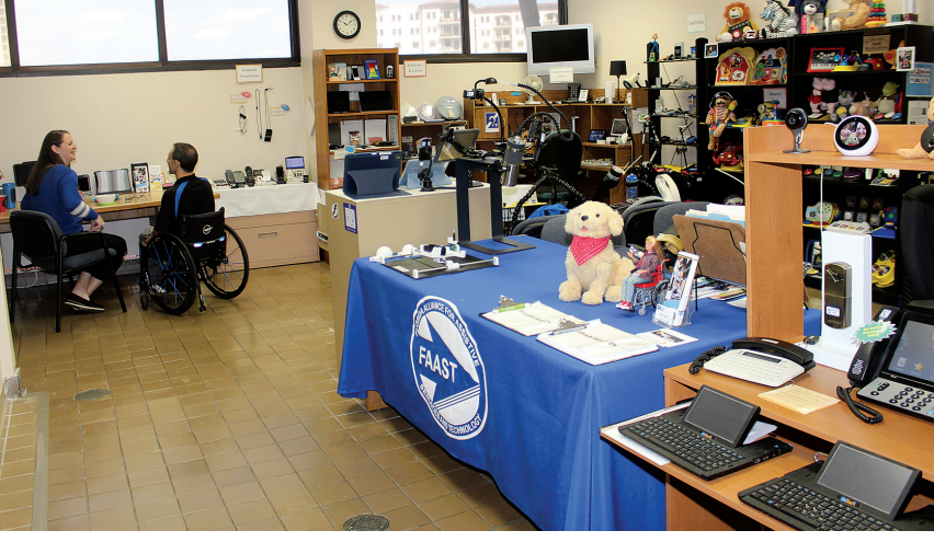
The FAAST Office on the Tampa General Campus

And as a Level I Trauma Center and Commission on Accreditation of Rehabilitation Facilities (CARF)-accredited rehabilitation hospital, having FAAST within our arsenal of services greatly enhances our world-class care so patients can regain their quality of life.