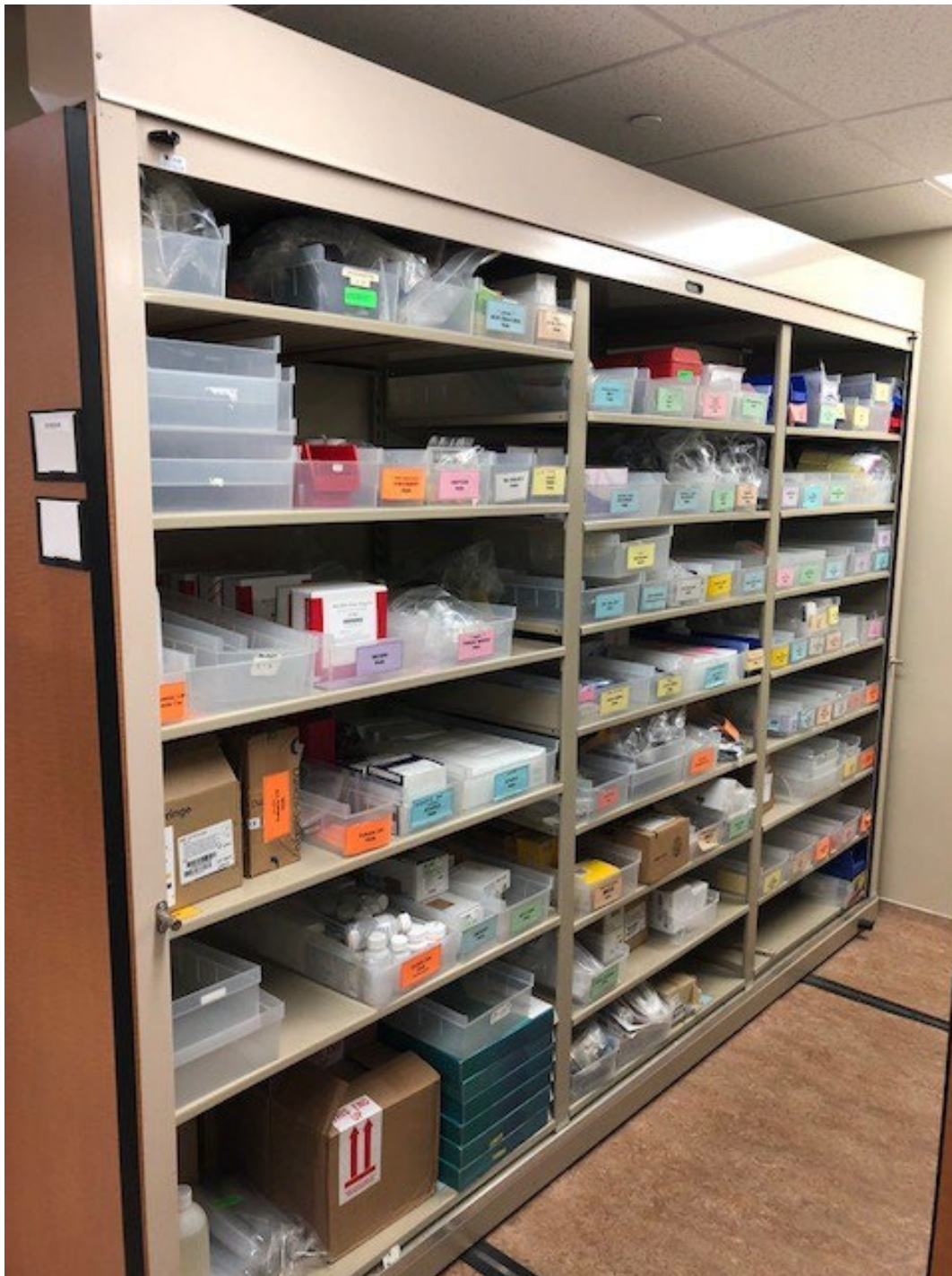
Rolling shelf storage for room temperature medications. The front cover pulls down and is kept locked when not in use.