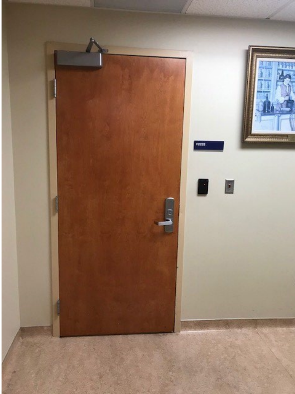
Main entrance to the Inpatient Pharmacy. It is located on the second floor of Tampa General Hospital, room F222E