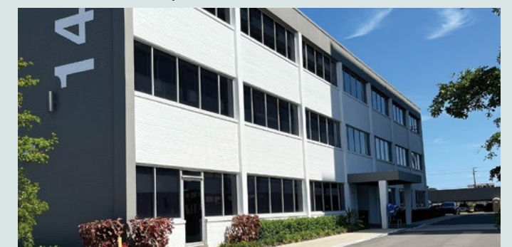
TGMG Westshore Outpatient Center